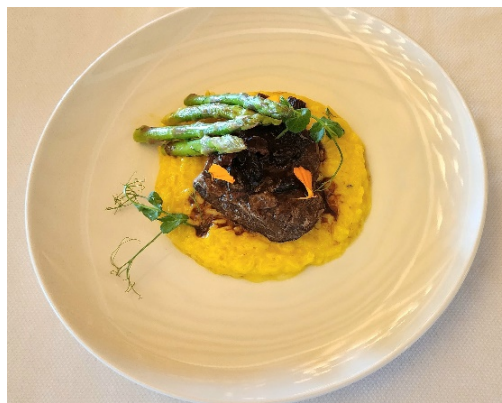
✳ Braised OX Cheek 37 Risotto alla Milanese, Sautéed Asparagus, Mushroom and Pepper Jus