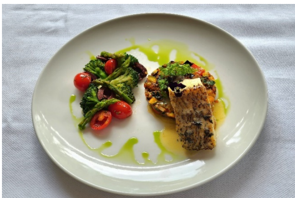
✳ Toothfish 42 Vegetable Caponata