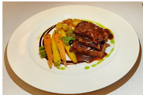
* Costolette di Maiale alla Grigliata 17 Pork Ribs, Baby Carrots, Asparagus, Crack Potatoes and Wine Jus