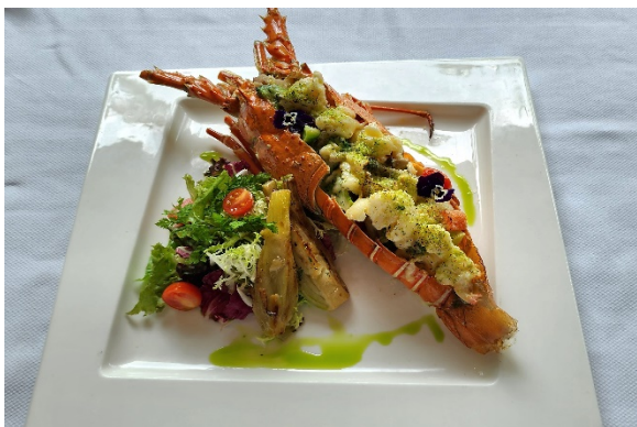
* Aragosta in Camicia 66 Tender Lobster, Confit Fennel & Turnip and Pinot Grigio