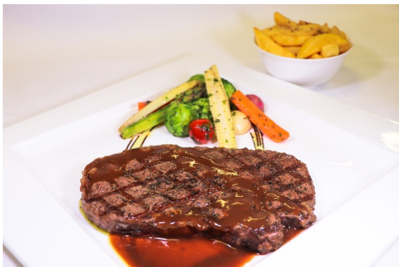
* Costata di Manzo 41 Beef Ribeye, Grilled Vegetables, Truffle Fries, Wine Jus