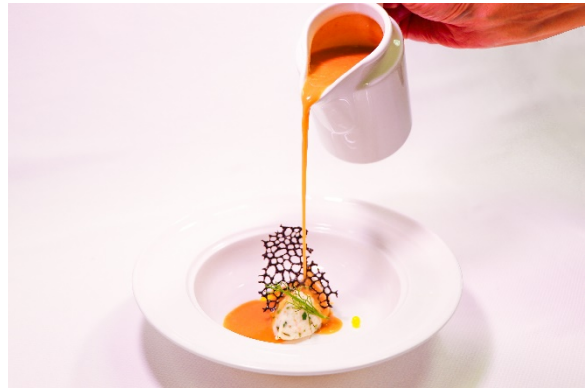
* Bisque di Mare 05 Creamy Seafood Essence, Prawn Quenelle, Squid Ink Tuile, Basil Oil Trickle, Fresh Herbs