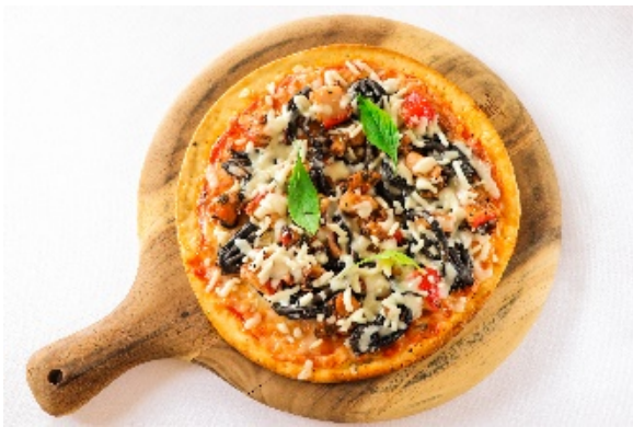
Frutti De Marre

Barbeque Chicken, Smoked Paprika, Jalapenos