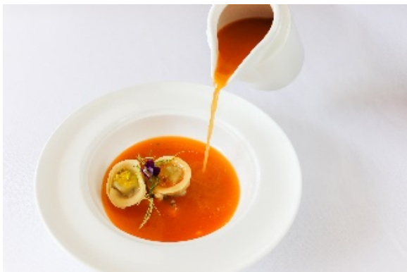
Zuppa Di Agnello Alla Pugliese Ground Herbs, Pulled Roast Lamb & Ricotta Cheese Tortellini, Basil Oil Trickle