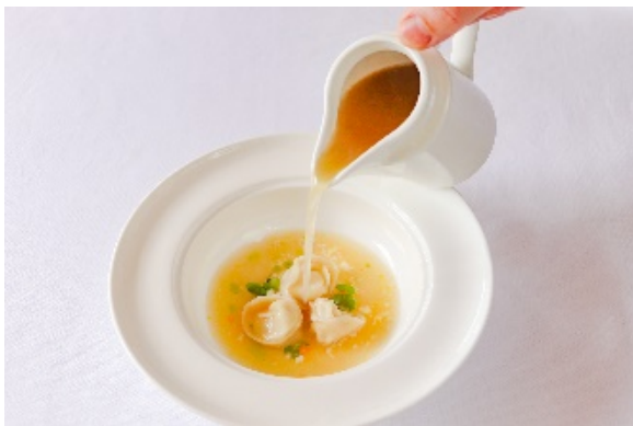
Brodo di Pollo Healthy Chicken Broth, Chicken Tortellini, Basil Oil Trickle, Fresh Herbs