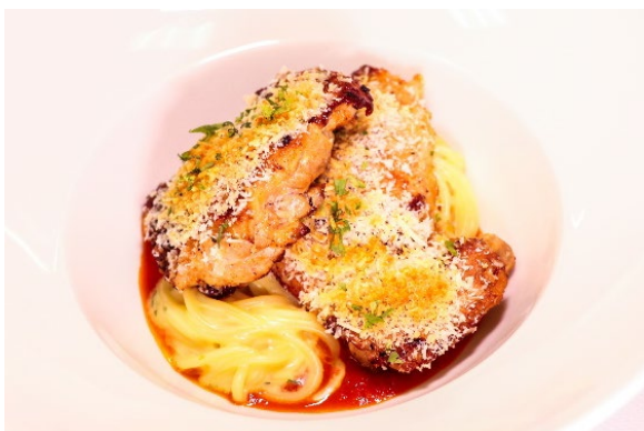
Pollo alla Parmigiana

Maldivian Tuna, Garden Vegetables, Truffle Fries, Lemon & Orange Emulsion