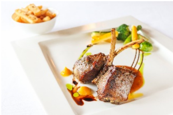
Costolette d' Agnello Garlic Lamb Rack, Garden Vegetables, Truffle Fries, Wine Jus