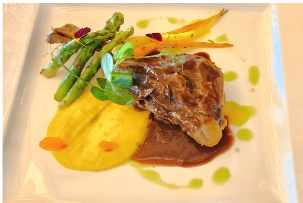
✳ Ossobuco 27 Slow cooked lamb shank, Red wine glaze, Creamy Polenta, Seasonal Vegetable