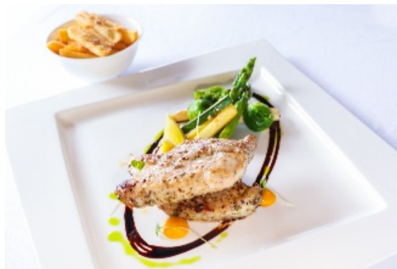
Pescato del Giorno

Buttered Portobello & Mushrooms, Mascarpone Cheese, Confit Pumpkin, Creamy Tomato Jus