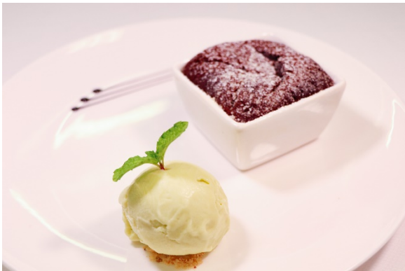
Molten Chocolate Cake Avocado Ice Cream, Cardamom Crumble