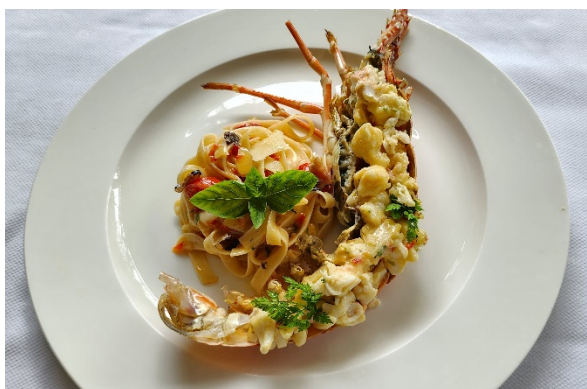
✳ Tagliatelle all'astice 36 Truffle carpaccio