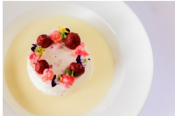
Torta Tres Leches Vanilla Strawberry Cream, Sponge, Fresh Berries