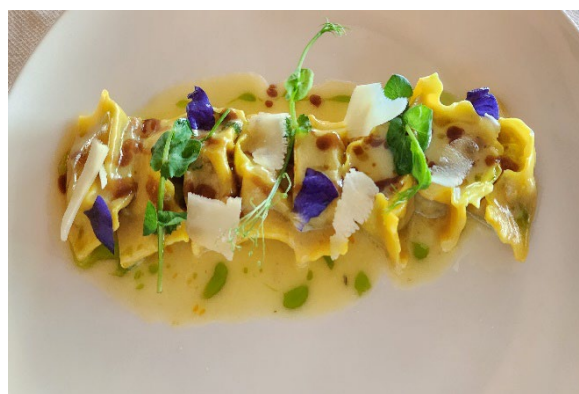
Agnolotti d'anatra Basil Butter Emulsion, Red Wine Glaze