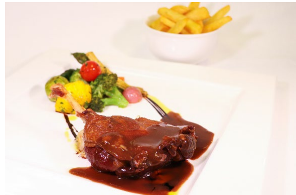
Petto d' Anatra Confit Duck Leg, Grilled Vegetables, Truffle Fries, Cherry Wine Jus